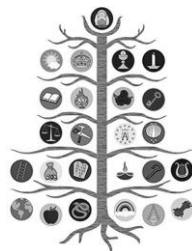
The Jessie Tree